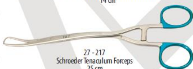
27 - 217 Schroeder Tenaculum Forceps 25 cm