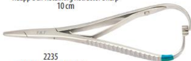
2235 Methieu Needle Holder 14 cm