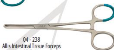
04 - 238 Allis Intestinal Tissue Forceps 15.5 cm