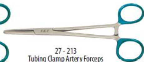
27 - 213 Tubing Clamp Artery Forceps 20 cm