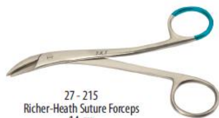
27 - 215 Richer-Heath Suture Forceps 14 cm