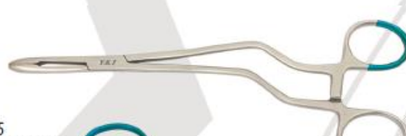
27 - 218 Sims-Maier Dressing Forceps 28 cm