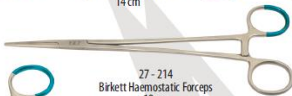
27 - 214 Birkett Haemostatic Forceps 19 cm