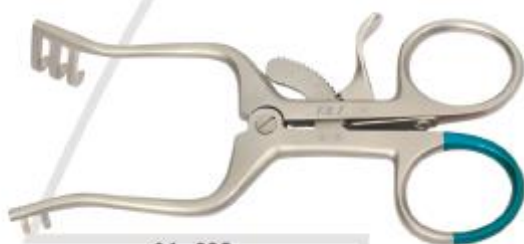
06 - 225 Weitlaner Self Retaining Retractor Sharp 13 cm