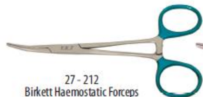
27 - 212 Birkett Haemostatic Forceps 19 cm