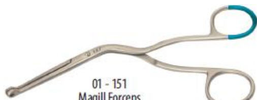
01 - 151 Magill Forceps 20 cm