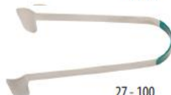
27 - 100 Thudicum Nasal Speculum