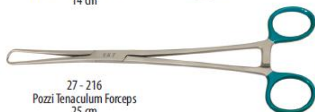
27 - 216 Pozzi Tenaculum Forceps 25 cm