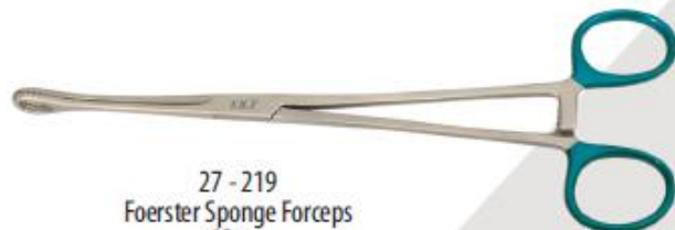
27 - 219 Foerster Sponge Forceps 18 cm