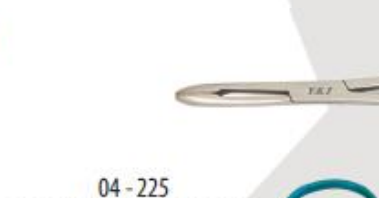
04 - 225 Gross Maier Dressing Forceps 20 cm